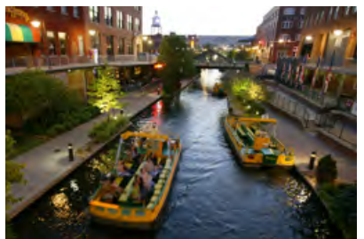
Oklahoma City has redesigned public spaces to make them more walkable.